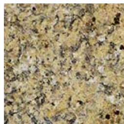
New Venetian Granite Set 2