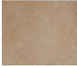
Thala Beige set 2