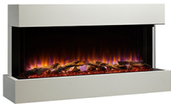
Floating Mantel Kit for Scion Trinity