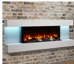
60" Floating Mantel Kit for Format