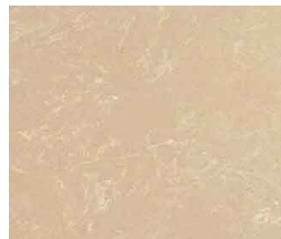
Beige Marble Set 2