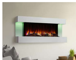
50" Floating Mantel Kit for Format