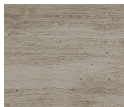
Parchwood set 2