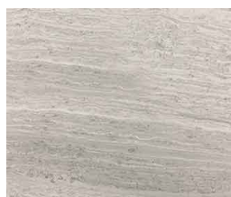
Driftwood set 2