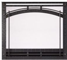
Chateau Forge Front