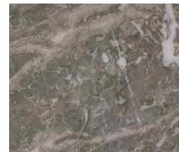
Blue Tundra set 2