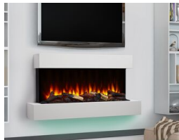
43" Floating Mantel Kit for Format