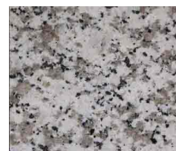
Pauline Granite Set 2