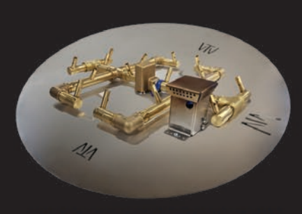
PLATE WITH IGNITION KNOCKOUTS