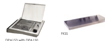
DPA153 with DPA150