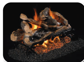
RRSO-2 Rugged Split Oak