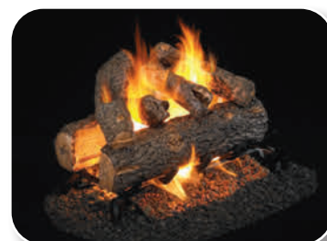
RDP-2 Golden Oak