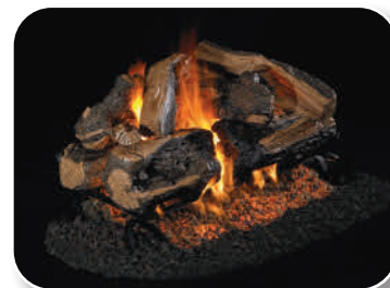
CHRRSO-2 Charred Rugged Split Oak