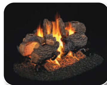
CHD-2 Charred Oak