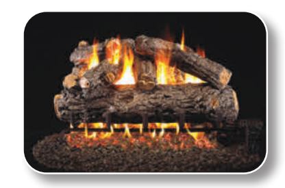
HRD Rustic Oak Designer