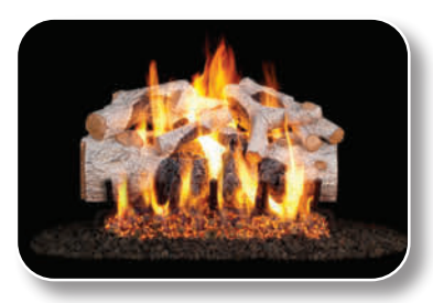
CHMBW Charred Mountain Birch