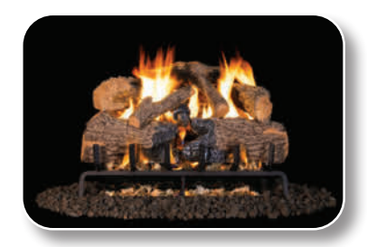
CHNA Charred Angel Oak