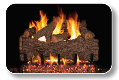
CN Chestnut Oak