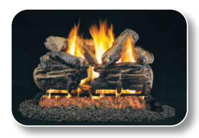
CHS Charred Split