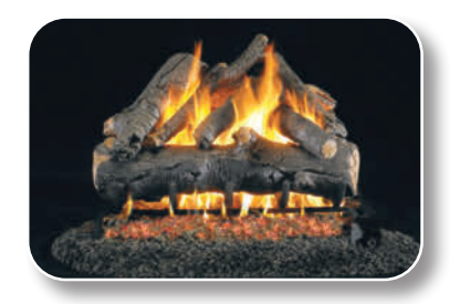
AO American Oak