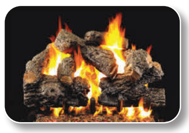
CHB Charred Royal English Oak