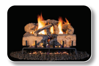
CHNS Charred Angel Oak Split