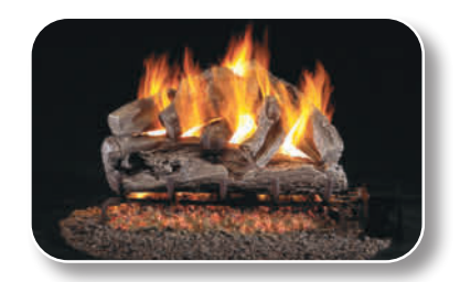
CDR - Coastal Driftwood