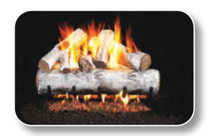
W - White Birch