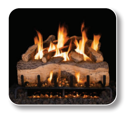
MCS Mountain Crest Split Oak

NOTE: CHARRED OAK (CHD), CHARRED SPLIT (CHS), CHARRED AMERICAN OAK (CHAO), CHARRED ROYAL ENGLISH OAK (CHB), CHARRED ANGEL OAK (CHNA) AND CHARRED ANGEL SPLIT OAK (CHNS) ARE ALSO COMPATIBLE W/ G31 BURNER SYSTEM.