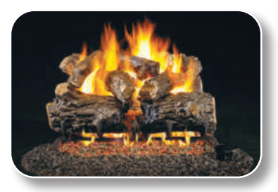
HCHR Burnt Rustic Oak