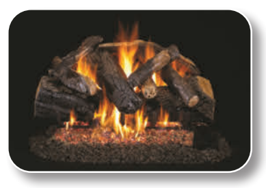
CHMJ Charred Majestic Oak