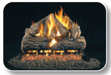
CHD Charred Oak