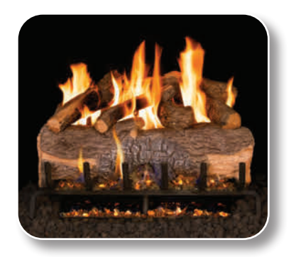
MCO Mountain Crest Oak