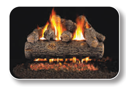
RDP Golden Oak Designer Plus