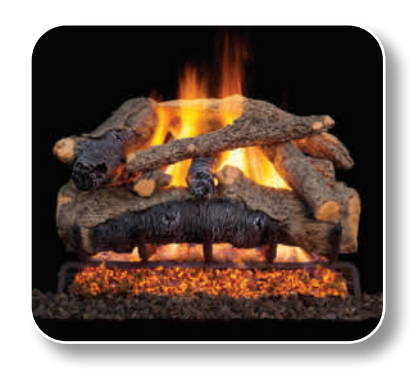
CLO Colonial Oak