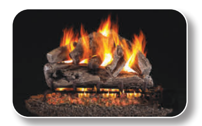
RRO - Rugged Oak