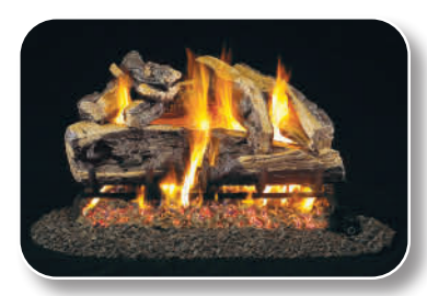
CHRRSO Charred Rugged Split Oak