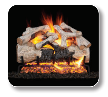
BTA Burnt Aspen