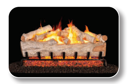
MBW - Mountain Birch