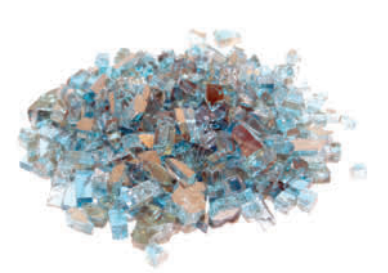
Azuria Reflective Glass