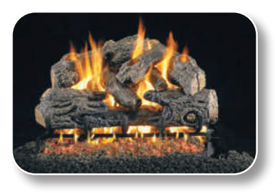
CHN Charred Northern