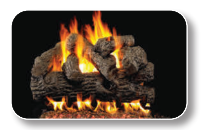
B - Royal English Oak