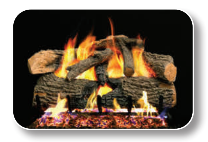
ENO Charred Evergreen Oak