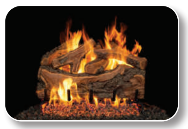
RFS Rugged Forest Split