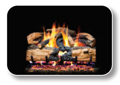
ENS Charred Evergreen Split Oak