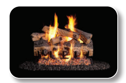
GSO Gnarled Split Oak