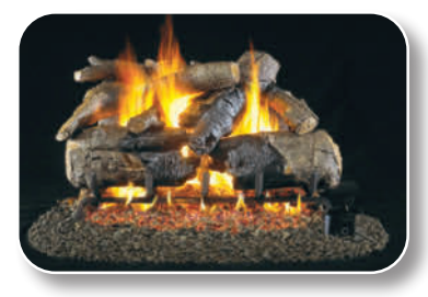
CHAO Charred American Oak