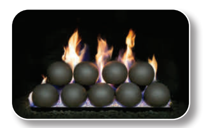
FS5-xx-EB Epic Black Fyre Spheres