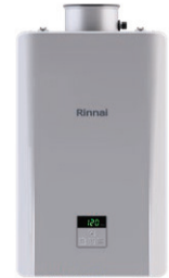
RE INTERIOR MODEL

*Item# HEPumpKitCR can be purchased to add recirculation to RE Models