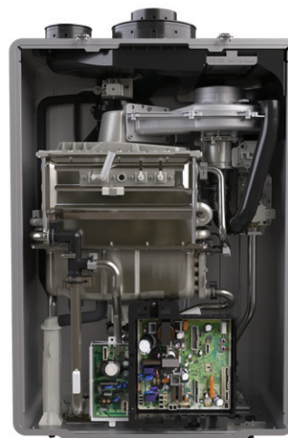
RX - INTERNAL

* Outdoor vent cap (RXOVC) required for exterior installation