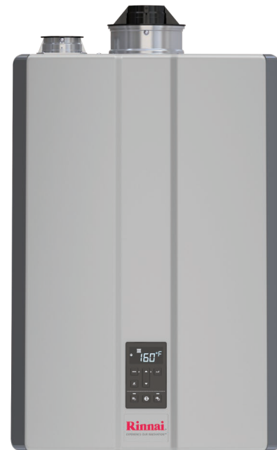
I SERIES BOILER