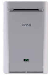
RE EXTERIOR MODEL