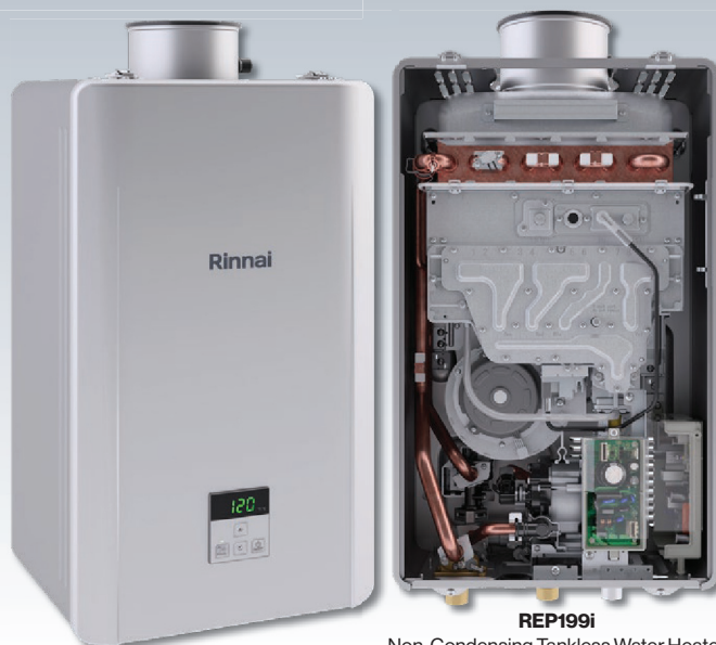
REP199i Non-Condensing Tankless Water Heater with Built-in Recirculating Pump (interior)

The First and Only Non-Condensing Unit with a Built-In Pump and Featuring Smart-Circ™ Intelligent Recirculation™