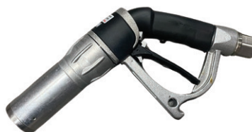
P158 - GG20.HSL