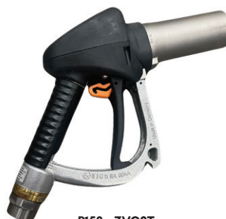
P158 - ZVG2T