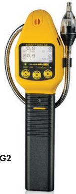
SENSIT GOLD G2