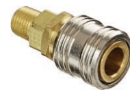
SOCKET X MPT