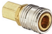
SOCKET X FPT