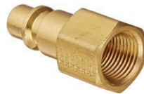
PLUG X FPT