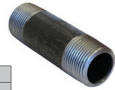
SCH 80 NIPPLE