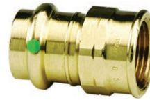
P X FPT ADAPTER