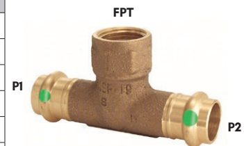
LEAD FREE BRONZE TEE