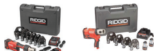
57363 - RP241 TOOLKIT