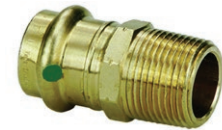
P X MPT ADAPTER