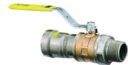
MPT X P VALVE