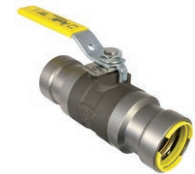
P X P VALVE