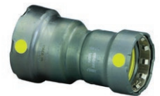
P X P REDUCER