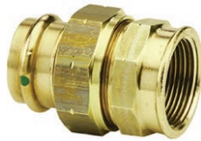
P X FPT UNION