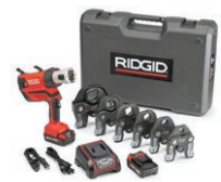
67053 - RP350 TOOLKIT