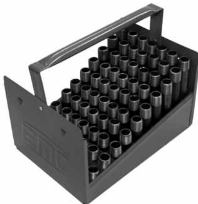
Nipple Tray with Nipples Included