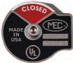
Check Valve Indicator "CLOSED"