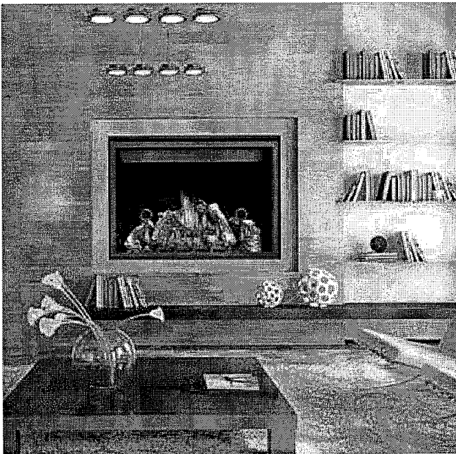
HD46 shown with Napoleon's exclusive PHAZER® log set

Napoleon's HD46 features a clean face design that easily complements a contemporary or traditional style. The choice of either Napoleon's realistic PHAZER® log set or the optional modern River Rock ember bed brings forth two fireplace experiences that simply light up the room. The 46" firebox dimension provides a substantial focal point for any room.